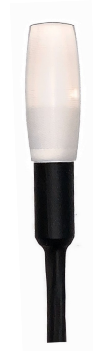
Swaying Reed, Steel rod