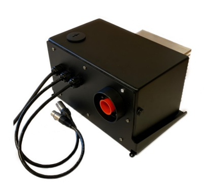
WARNING! Remove cap before turning on.